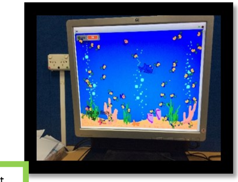
Some examples of Scratch and the final result when the game is finished.

During these lessons students have been working with a program called 'Scratch' which enables the students to complete coding. During Coding lessons students have created a game in which a shark eats yellow fish. Every time a yellow fish is eaten the Shark gains one point and every time a Red fish is eaten the game re-starts. Each character within the game requires a different script to be written.